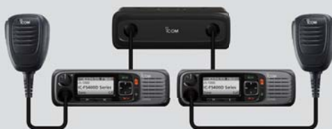
Dual Head Controller* Optional RMK-7, hand microphone and separation cables required.

A detached controller head with the separated RF unit is a simple to install in almost any vehicle.