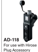
AD-118 For use with Hirose Plug Accessory