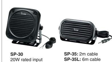
SP-30 20W rated input