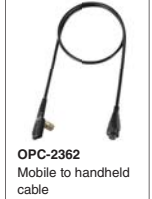
OPC-2362 Mobile to handheld cable