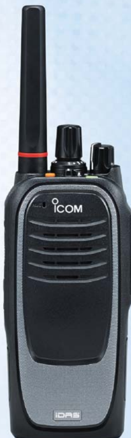
VHF DIGITAL TRANSCEIVER IC-F3400D UHF DIGITAL TRANSCEIVER IC-F4400D