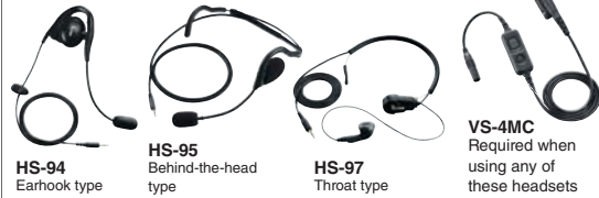
HS-94 Hook type