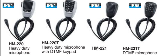
HM-220 Heavy duty microphone