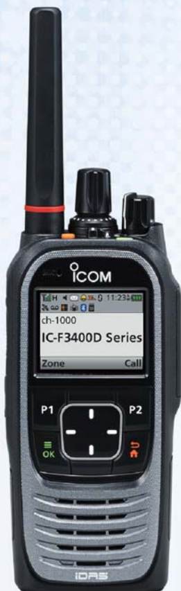
VHF DIGITAL TRANSCEIVER IC-F3400DS UHF DIGITAL TRANSCEIVER IC-F4400DS