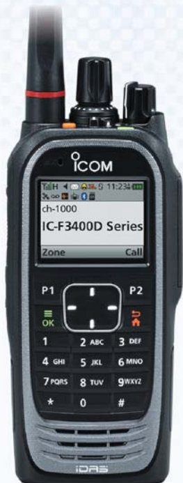
VHF DIGITAL TRANSCEIVER IC-F3400DT UHF DIGITAL TRANSCEIVER IC-F4400DT