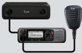
Detached Controller* Optional RMK-5 and separation cable required.

With a combination with optional separation kits, COMMANDMIC and separation cables, three types of controller configurations are available to suit almost any application or installation that may be required. The intercom function is available between controllers and/or COMMANDMIC.