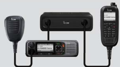
COMMANDMIC™ and Detached Controller* Optional RMK-5, COMMANDMIC, HM-218 and separation cables required.

Suitable for double cab vehicles. Install the controller head to front and rear seats respectively.