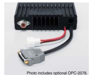
Photo includes optional OPC-2078.

The optional ACC cable allows you to connect with various external devices to control audio output, modulated signal input, remote channel control, horn honk and many more functions. OPC-1939 is a D-SUB 15-pin type and OPC-2078 is a D-SUB 25-pin type.